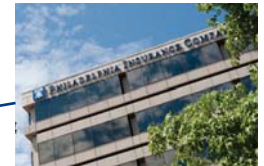
Corporate Headquarters Bala Cynwyd, Pennsylvania